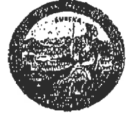
EDMUND G. BROWN JR. Governor